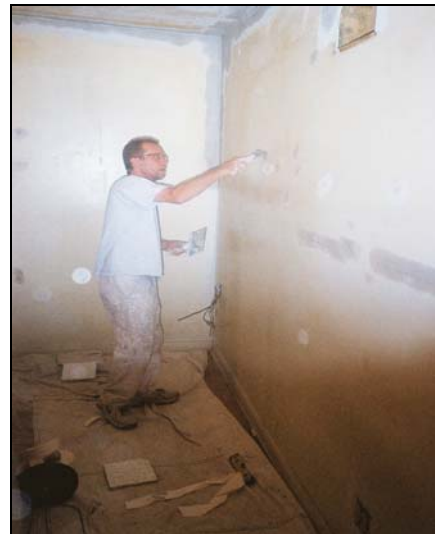
Working on the basement walls

The homeowner paid the taxes on July 19 th thanks to a temporary bridge loan predicated on the FHA approval, and the reverse mortgage was finalized a few days later.