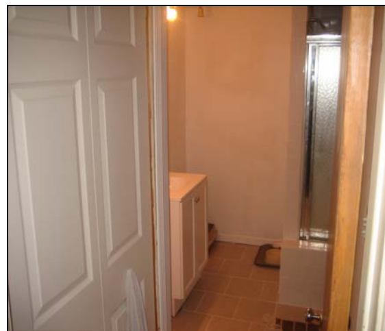
After photo of bathroom