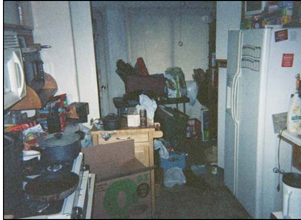
Before photo of kitchen