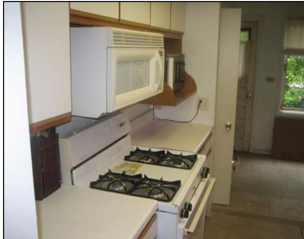
After photo of kitchen

This effort was the result of the collaboration of many people committed to the mission of Rebuilding Together North Suburban Chicago to enable people to remain in their homes in warmth, safety, independence and dignity. With the support of social services from the Township where the family lived, the generous support of Rebuilding Together funders (including the Township), the commitment of our volunteers and the efforts of our working Board, we were able to accomplish these results.