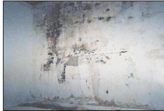
Before photo of basement walls

A dedicated Board Member led volunteers and talented skilled laborers for three weeks: replacing damaged walls with new drywall, installing flooring where there was none, installing new carpeting, painting most of the interior, renovating the primary bathroom, repairing kitchen cabinets, replacing counters, performing plumbing repairs, addressing multiple basement leaks, cleaning and removing truck loads of clutter with the family's help. The home passed the FHA appraisal.